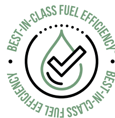
MID-RANGE FUEL CONSUMPTION VS. CAPACITY